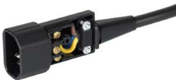
Example with assembled cable