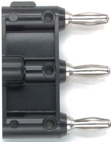
Model 2970 Triple Banana Plug