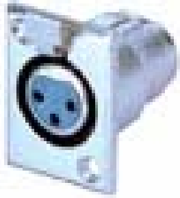
Model 5113A XLR (F) 3-pin rectangular flanged mount

Protect contacts and absorb vibrations in your audio applications