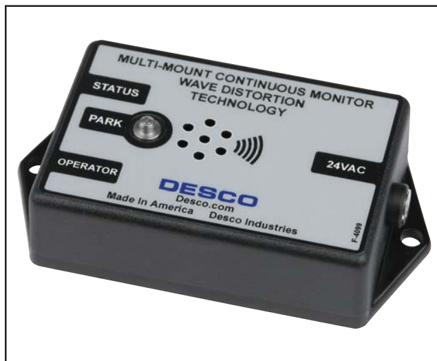
Figure 1. Desco Multi-Mount Continuous Monitor.