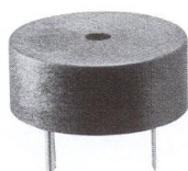
φ 17.0 × H7.0