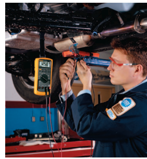
Powerful magnet holds meter to most steel surfaces