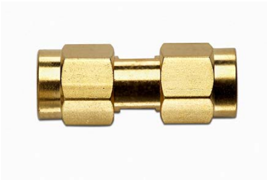
Model 72964 SMA PLUG (M) / PLUG (M)

High bandwidth, small size, and durability for confident connections.