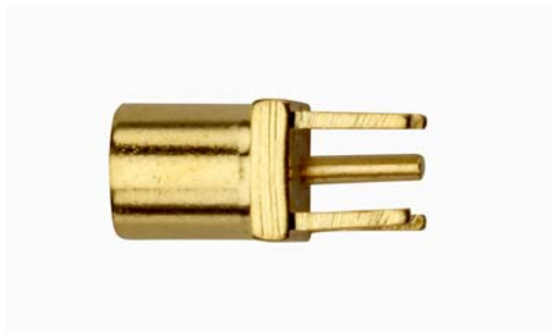
Model 73039 MMCX JACK STRAIGHT EDGECARD

Snap-on coupling and micro-miniature size for fast connect and disconnect where space is limited