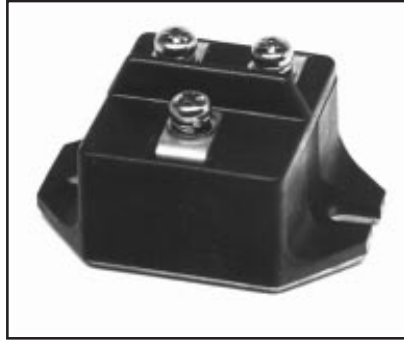
CS241020 Fast Recovery Single Diode Module 200 Amperes/1000 Volts