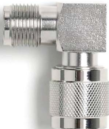
Model 73053 TNC Right-Angle Jack to Plug Adapter