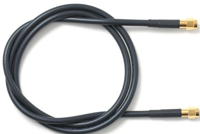
Model 4846-C SMA Plug to SMA Plug, RG58C/U

Small size, and durability for confident connections