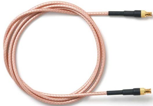
Model 73075-VV MCX Plug to MCX Plug, RG179B/U, 75 Ohm

Snap-on coupling and miniature size for fast connect and disconnect where space is limited