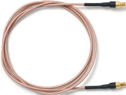
Model 73075-UU MCX Plug to MCX Plug, RG178B/U, 50 Ohm

MCX Plug to MCX Plug, RG178B/U (50 Ohm), RG179B/U (75 Ohm)