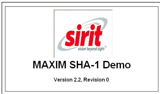
Figure 2. Evaluation Software Greeting