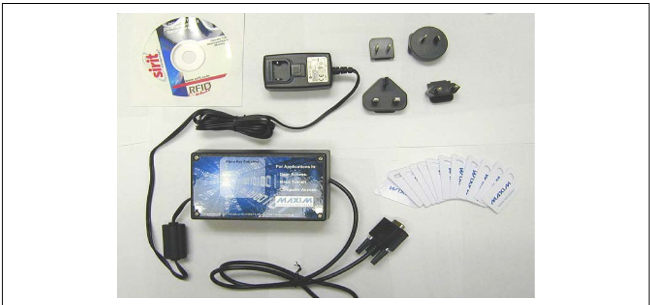
Figure 1. MAX66901 EV Kit Contents

Now refer to the MAX66xx0K_Evaluation_Guide in the Documentation folder on the CD and the sections that apply to the RFID keys to be evaluated. To communicate with an RFID key, the key must be placed on the location marked "Place Key Fob Here."