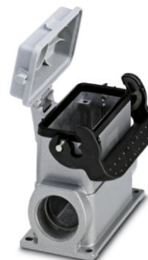
Photo shows product without screw connection

http://eshop.phoenixcontact.de/phoenix/treeViewClick.do?UID=1771189