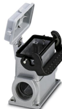
Figure shows product variant without screw connection

http://eshop.phoenixcontact.de/phoenix/treeViewClick.do?UID=1771697