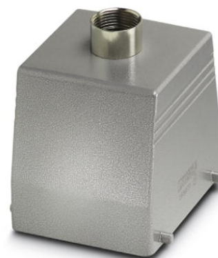
Photo shows sleeve housing with support

http://eshop.phoenixcontact.de/phoenix/treeViewClick.do?UID=1647307