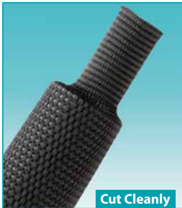
Cut Cleanly Scissor