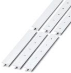
Zack marker strip, Strip, white, Labeled, Printed horizontally: L1, L2, L3, N, PE, Mounting type: Snap into tall marker groove, For terminal block width: 15.2 mm, Lettering field: 10.5 x 15.1 mm

Please be informed that the data shown in this PDF Document is generated from our Online Catalog. Please find the complete data in the user's documentation. Our General Terms of Use for Downloads are valid ( http://download.phoenixcontact.com )