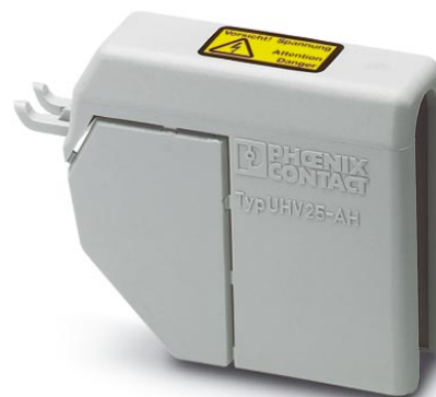
Illustration shows the product version UHV 25-AH

http://eshop.phoenixcontact.de/phoenix/treeViewClick.do?UID=2130457