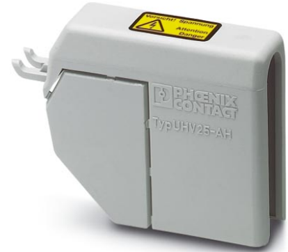
Illustration shows the product version UHV 25-AH

http://eshop.phoenixcontact.de/phoenix/treeViewClick.do?UID=2130473