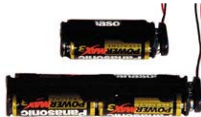
Cable Gland & Battery Kits