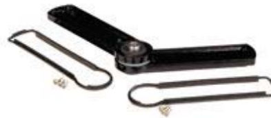
(click to enlarge) Variable Style