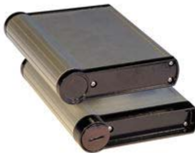
(click to enlarge) Flat Style (Top) Collar Style (Bottom)