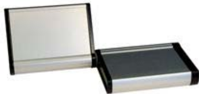
(click to enlarge) Variable Plate In Use