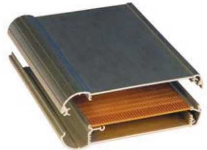
Example Application (Assembled View)