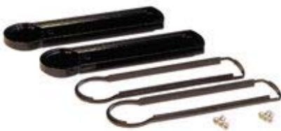
(click to enlarge) Flat Style