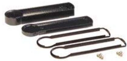
(click to enlarge) Collar Style