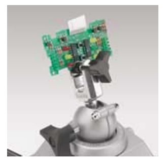
Click on any of the above images to find out more about the products pictured.