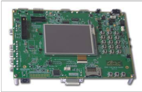
AM/DM37x Evaluation Module