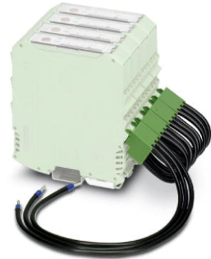
Figure shows variant for 4 modules

http://eshop.phoenixcontact.de/phoenix/treeViewClick.do?UID=2900749