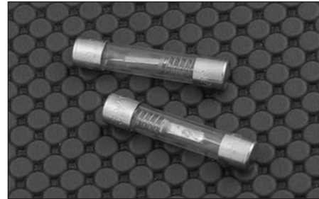
Dimensions - mm (in)