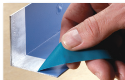
Clean removal, sharp paint edge.