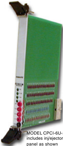
MODEL CPC1-6U-25-L, includes inj/ejector & panel as shown