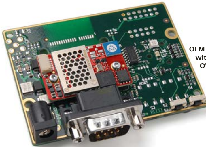
OEM RS232 Module Adapter III with Wireless LAN module OWSPA311gi