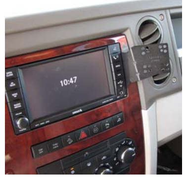
Final Install Picture, Jeep Commander