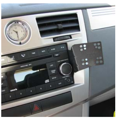
Final Install Picture, Sebring

STEP#3: Install the top part of InDash by PanaVise Mount with the (2) Acorn nuts. Replace the bezels in reverse order. INSTALLATION IS NOW COMPLETE. ENJOY YOUR NEW INDASH by PANAVISE MOUNT.