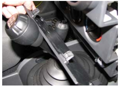
Lower Cover Plate

INSTALLATION IS NOW COMPLETE. ENJOY YOUR NEW INDASH by PANAVISE MOUNT.