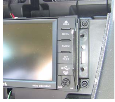
Chrysler 200 bottom in place