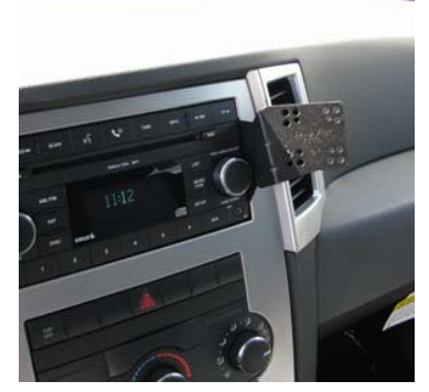
Final Install Picture Jeep Grand Cherokee

Read instructions completely prior to starting installation. All InDash Mounts are designed so that after installation, phone is facing normal driver position for lefthand drive vehicles. This mount is not designed to be used in foreign countries with right-hand drive vehicles. Use extreme care when working around the plastic components on the dash. Excess force, can cause breakage of the plastic components.