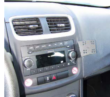
Finished Install of 11-12 Avenger