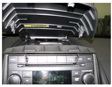
Cover Removal and screws under cover