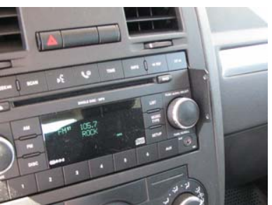
Bottom part in place without Nav

STEP#3: Install the top part of InDash by PanaVise Mount with the (2) Acorn nuts. Replace the bezels in reverse order.