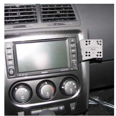
Install Picture of InDash on Challenger

Read instructions completely prior to starting installation. All InDash Mounts are designed so that after installation, phone is facing normal driver position for lefthand drive vehicles. This mount is not designed to be used in foreign countries with right-hand drive vehicles. Use extreme care when working around the plastic components on the dash. Excess force, can cause breakage of the plastic components.