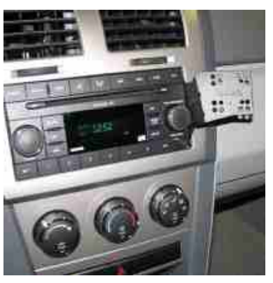
Finished Install of 08-10 Avenger

STEP#4: Reinstall the radio-airvent bezel, and dash top bezel. Install the top part of InDash by PanaVise Mount with the (2) Acorn nuts using 5/16" wrench. INSTALLATION IS NOW COMPLETE, ENJOY YOUR NEW INDASH BY PANAVISE MOUNT!