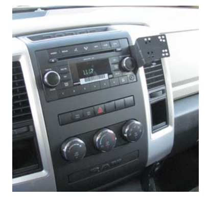
Install Picture of InDash of Dodge Ram 1500