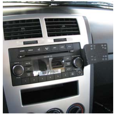
Install Picture of InDash on 09 Dodge Caliber 05-26-15