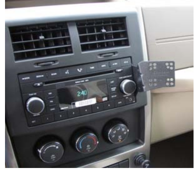
Jeep Liberty 2011 Install