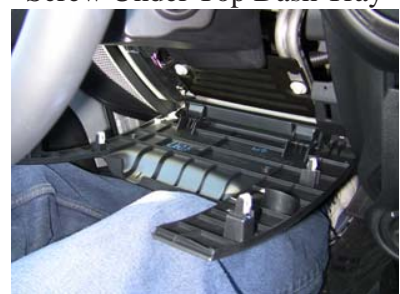
Knee Panel Removal