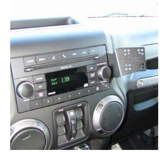
Jeep Liberty 2011 Final Install

INSTALLATION IS NOW COMPLETE, ENJOY YOUR NEW INDASH BY PANAVISE MOUNT!