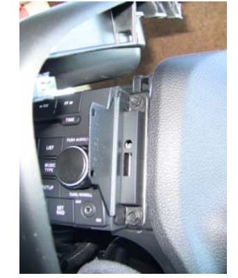
Liberty Bottom Part Install