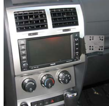
Install Picture of InDash on Dodge Nitro