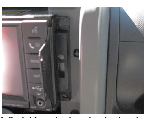
InDash Mount in place showing location