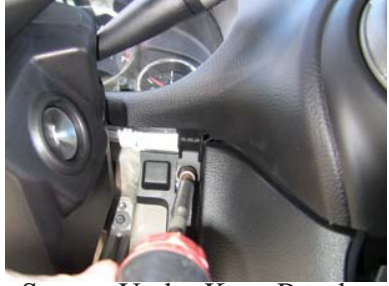
Screws Under Knee Panel