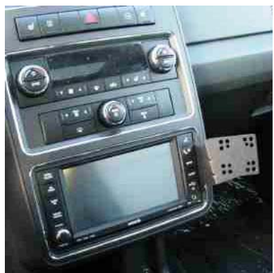
Install Picture of InDash on Dodge Journey

Read instructions completely prior to starting installation. All InDash Mounts are designed so that after installation, phone is facing normal driver position for lefthand drive vehicles. This mount is not designed to be used in foreign countries with right-hand drive vehicles. Use extreme care when working around the plastic components on the dash. Excess force, can cause breakage of the plastic components.