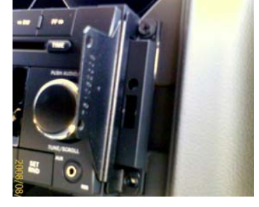
Install Picture of bottom part of mount on radio