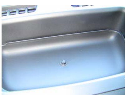
Screw Under Top Dash Tray

Read instructions completely prior to starting installation. All InDash Mounts are designed so that after installation, phone is facing normal driver position for lefthand drive vehicles. This mount is not designed to be used in foreign countries with right-hand drive vehicles. Use extreme care when working around the plastic components on the dash. Excess force, can cause breakage of the plastic components.