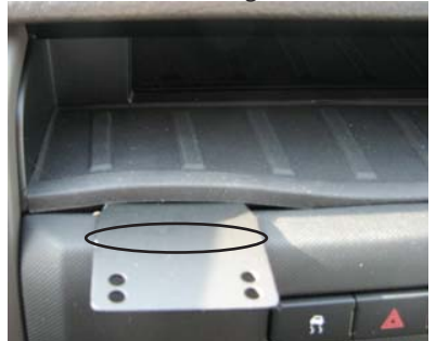
Rubber Mat Cut Area