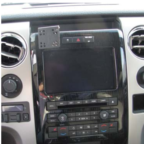
Mount in Place with Mounting Plate in Left Side Down Position on Nav.