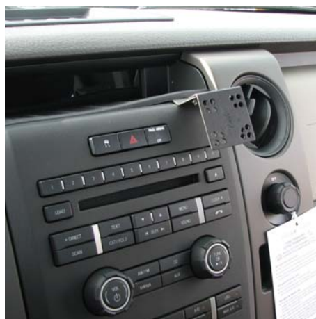
Mount in Place with Mounting Plate in Right Side Down Position