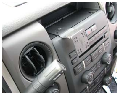
Mount in Place with Mounting Plate in Left Side Down Position