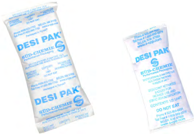
13843 & 13844

In order to provide a complete moisture barrier packaging assembly, desiccant must be inserted into the bag, prior to having the bag vacuum sealed. The recommended amount of desiccant is dependent on the interior surface area of the bag to be used. The table is a reference indicating recommended minimum amounts of desiccant that should be used with Moisture Barrier Bags .