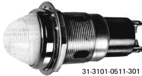
31-3101-0511-301 Torpedo lens