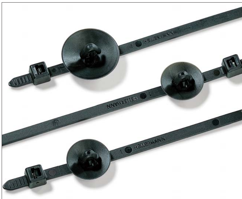
The 'tab' on the head of the tie makes it easy to locate and lift the head for assembly.

With a diverse range of fixing possibilities (from 5.7mm to 6.5mm hole diameters and 0.7mm to 3.5mm panel thickness) this range of fixing ties are ideal for use in many different industries, for example: automotive, aerospace, rail, and panel building.