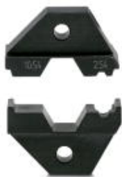
Spare die for CRIMPFOX-CX 10,54

Please be informed that the data shown in this PDF Document is generated from our Online Catalog. Please find the complete data in the user's documentation. Our General Terms of Use for Downloads are valid ( http://download.phoenixcontact.com )