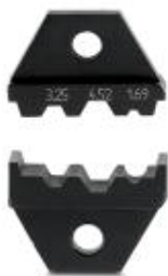
Spare die for CRIMPFOX-CX 4,52

Please be informed that the data shown in this PDF Document is generated from our Online Catalog. Please find the complete data in the user's documentation. Our General Terms of Use for Downloads are valid ( http://download.phoenixcontact.com )