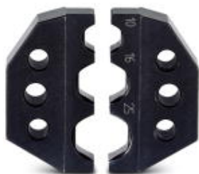
Spare die for CRIMPFOX-RCT 25-1

Please be informed that the data shown in this PDF Document is generated from our Online Catalog. Please find the complete data in the user's documentation. Our General Terms of Use for Downloads are valid ( http://download.phoenixcontact.com )