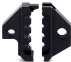
Spare die for CRIMPFOX-TC 4

Please be informed that the data shown in this PDF Document is generated from our Online Catalog. Please find the complete data in the user's documentation. Our General Terms of Use for Downloads are valid ( http://download.phoenixcontact.com )