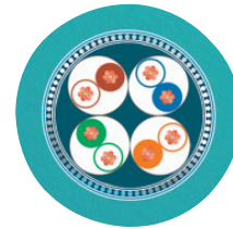
Ethernet, flexible, CAT5e [94B]