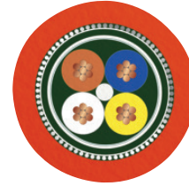
Sercos III [93K]