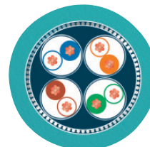
Ethernet 10 Gbit [94F]