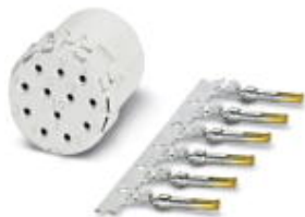
The figure shows the 12-pos. product version

Contact insert, Number of positions: 17, Type of contact: Socket, Crimp connection