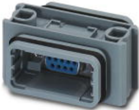
D-SUB coupling, shell size 1, socket, gender changer, shielded, connection direction straight, IP67 degree of protection

Please be informed that the data shown in this PDF Document is generated from our Online Catalog. Please find the complete data in the user's documentation. Our General Terms of Use for Downloads are valid ( http://download.phoenixcontact.com )