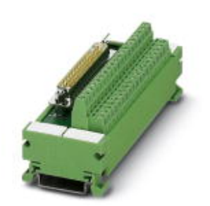
The illustration shows the version UM 45-D37SUB/S

VARIOFACE module, with screw connection and D-subminiature socket strip, for assembly on NS 35/7.5, 50 positions (no consecutive numbering)