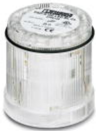
LED blinking light element, 24 V AC/DC, clear

Please be informed that the data shown in this PDF Document is generated from our Online Catalog. Please find the complete data in the user's documentation. Our General Terms of Use for Downloads are valid ( http://phoenixcontact.com/download )