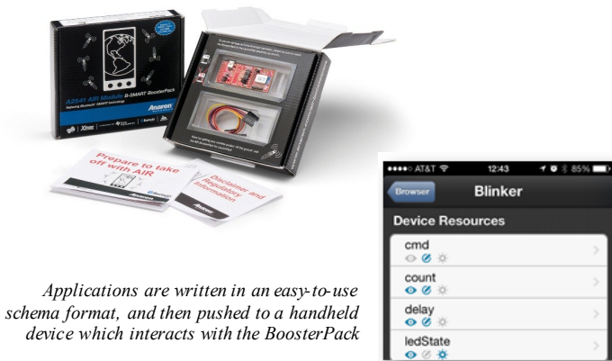
Applications are written in an easy-to-use schema format, and then pushed to a handheld device which interacts with the BoosterPack

Industrial controls and monitoring, remote controls, home/building automation, lighting systems, low power wireless sensor networks, and consumer electronics, sports monitoring, health & wellness, among many others