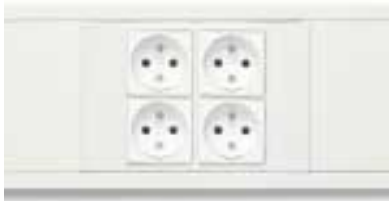
45x45 Modules (French) shown in T130FFMC.*