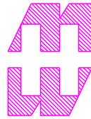
VIEW OF LID (INSIDE)