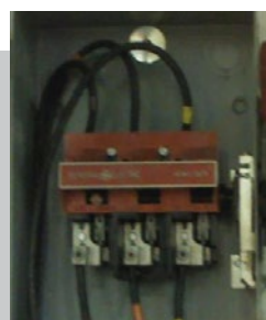
Three-phase Full Visible

Precisely blended visual and infrared images with crucial details to assist in identifying potential problems.