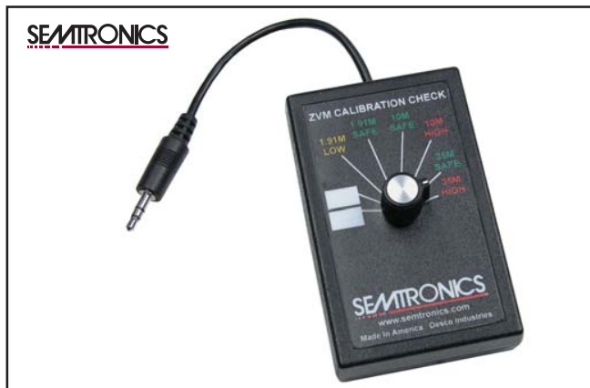
Figure 1. 62170 Limit Comparator

1. The purpose of the DUAL WIRE Limit Comparator Operator Calibration Check Resistor Box is to verify the calibration of the ZVM 62002(ZVM1002) and the 62030(SE900-1) by checking 4 operator conditions: FAIL LOW, PASS SAFE (low limit), PASS SAFE (high limit), and FAIL HIGH.