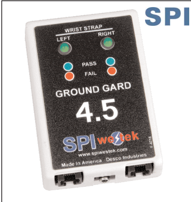
Figure 1. SPI Westek Ground Gard 4.5